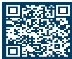
If you wish to donate to the work of the Kenelm Youth Trust please scan Here

Find out more about our work and how to get involved visit our website